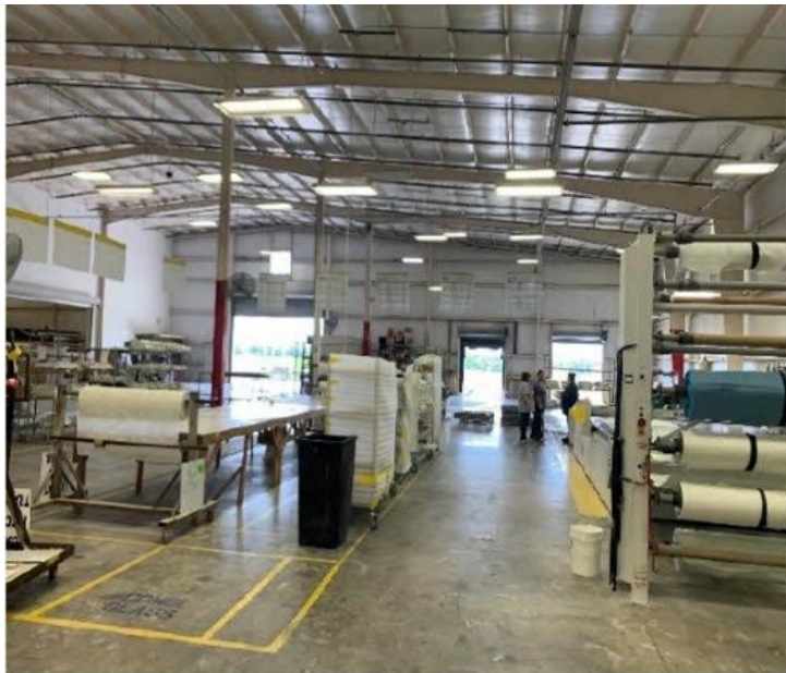
SHOP LOOKING SOUTH